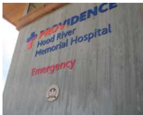
Look closely for their well-deserved LEED GOLD designation that Mt. Hood Meadows Emergency Clinic earned.