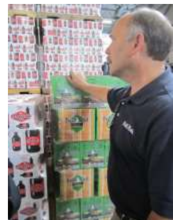
Much of what arrives at Full Sail Brewing is plastic-wrapped and they go to great lengths to be sure it is all recycled.