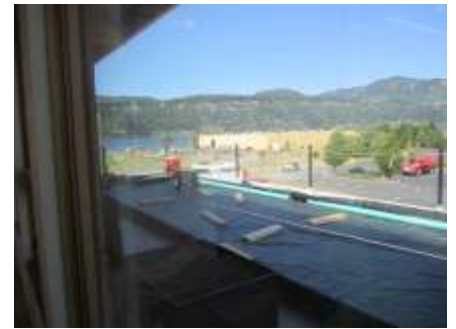
The view out the window to Turtle Island Foods' Bocce Ball court and planters. What a great place to work!