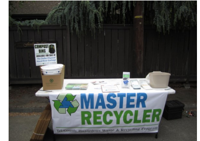
Scaled-down Tabling supplies

Farmers' Markets can be a fun way to meet people and spread the word about recycling, re-use and sustainability. You might even sell an "Earth Machine" compost bin and help someone get started on that composting goal of theirs. It is OK if you want to