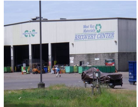
Waste Connection's West Vancouver MRF...come with us on Wednesday, February 29th, as we tour the facility and visit some related recycling sites.