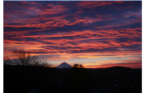
An Incredible Sunset from The Dalles