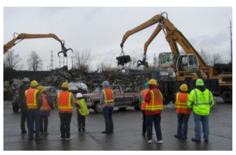
Our field trip group watching the action at Rivergate Scrap Metals

I am sharing this first because I found it fascinating, and secondly because I discovered that each of these facilities and facilities like them will take small amounts of recyclable material from individuals for a small fee. Before you