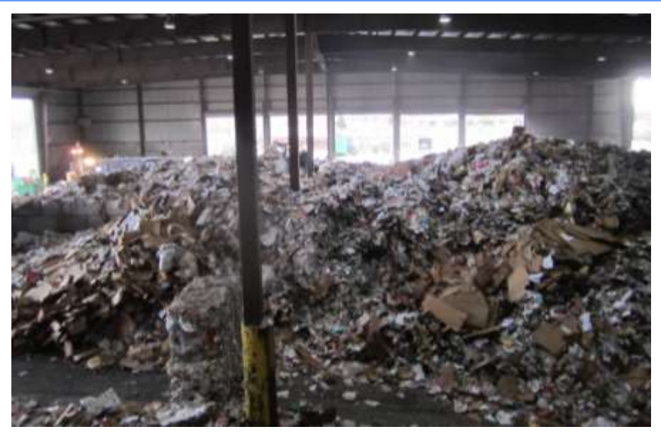
Incoming co-mingled recyclables to be sorted-YIKES!

looked we saw the ubiquitous plastic bag, floating through the air, clogging up machines, sticking out of bales of other materials, and just lying around. In spite of this pollution of materials, bale after bale of individual recyclables were processed for both the domestic and foreign markets. The non-recyclable components are also baled and either barged to Arlington, or trucked to The Dalles destined for the landfills, along