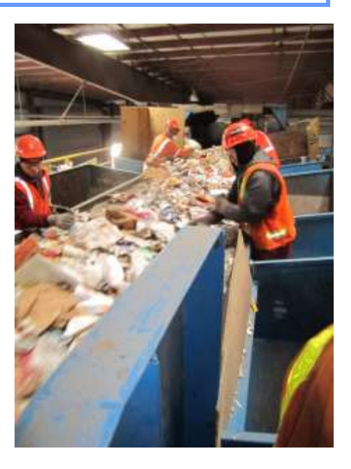
One of many "SORT LINES" in the MRF. These automated conveyer lines move FAST! It takes a trained eye and quick hands to catch items that made it through the screen don't belong on that line.