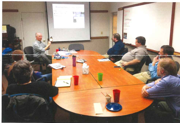
4-hour safety training

storage cabinets, eye wash stations, and improved ventilation). Tri-County Hazardous Waste & Recycling Program will then offer to assist with those upgrades so that schools, students and teachers have a safer learning environment.