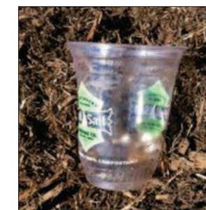
Is this cup compostible?

ings from local fruit processing facilities. The material is layered in long rows on a 1-acre asphalt pad, with water added, and the material "turned" with a front end loader