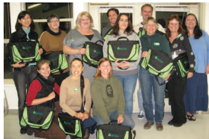
Fall 2010 class of Master Recyclers

Last fall, a bunch of Lenthusiastic folks from the Gorge engaged in some "trash talking" and enrolled in the Master Recycler training course offered by the TriCounty Hazardous Waste & Recycling Program. The course offers skills on how to reduce the amount of waste in the home and in the community. The program offers training for home composting, recycling and waste prevention, plus alternatives to household hazardous waste disposal and reducing toxics exposure.