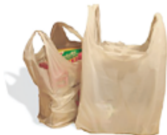
Grocery & Retail Bags labeled #2 (HDPE) or #4 (LLDPE)

Tip: Store in plastic bag until next trip to the store