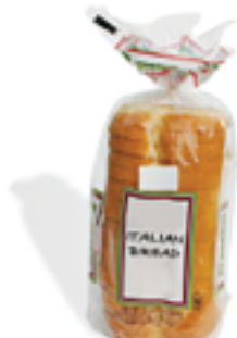
Bread Bags (with crumbs shaken out)