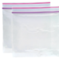
Food Storage Bags