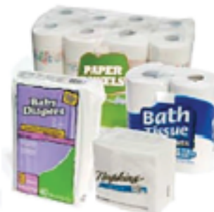
Napkin, Paper Towel, Bathroom Tissue, and Diaper Wrap Packaging

"Do Not Put In Recycling - Return to Supermarket"